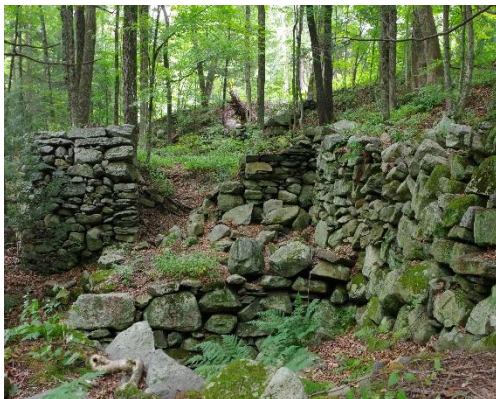
Fulling Mill, Charlton, MA